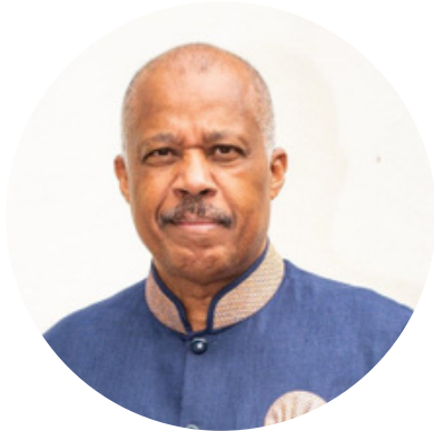
Prof. Sir Hilary Beckles

Vice-Chancellor, The University of the West Indies