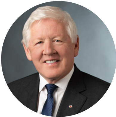
Ambassador Bob Rae

Ambassador and Permanent Representative of Canada to the United Nations